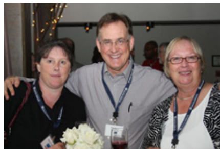
Representatives from Vermont and Kansas who attended the meeting.

To conclude the meeting, attendees traveled to the International Civil Rights Museum in downtown Greensboro for an informative and inspirational talk by Franklin McCain. Mr. McCain is one of the original Greensboro Four who took part in the Woolworth sit-ins in the 1960s. He went on to have a successful career and continues to make a difference in the world through his work in the educational, civic, spiritual and political spheres of the community.