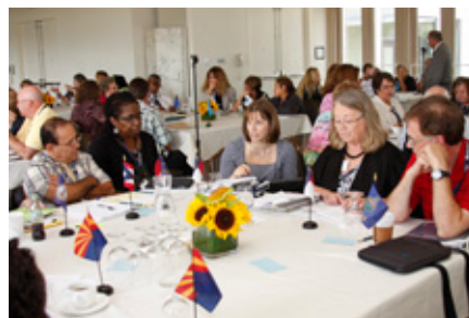
State board representatives discuss issues specific to their state.

NBCC held its annual state licensure boards meeting August 11-12 in Greensboro, North Carolina. The meeting was attended by 65 state licensure board representatives from 34 states, the District of Columbia and Puerto Rico. This annual meeting is an important tool for cultivating strong working relationships with state licensure boards that enable us to better serve our certificants. This year, we invited board members and administrators from each licensure board in an effort to better understand each state's licensure process.